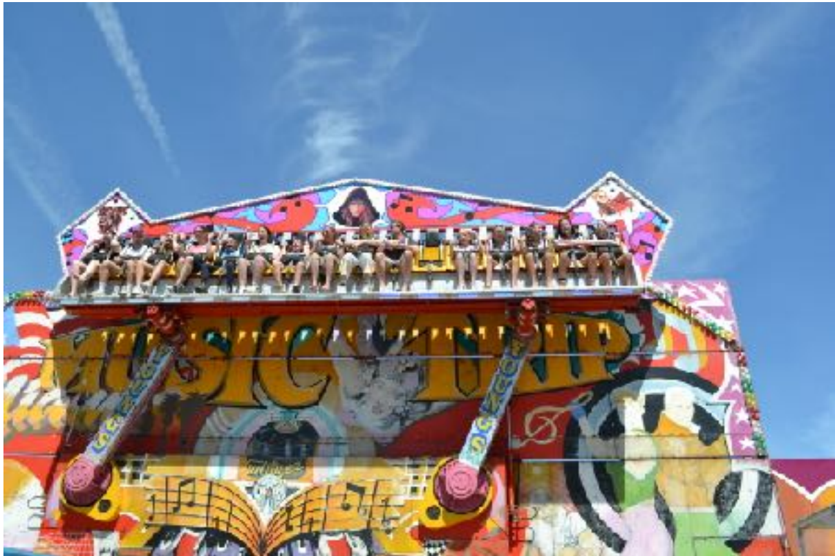
2024 SHOW